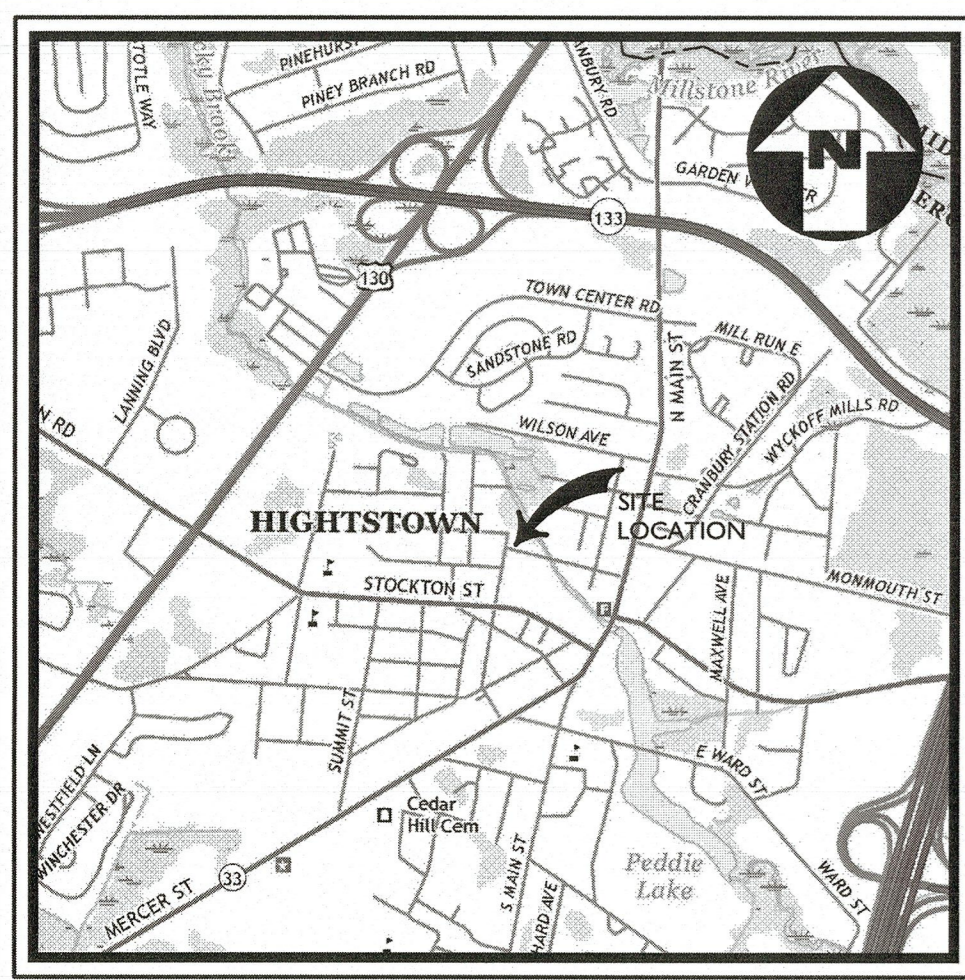
VICINITY MAP U.S.G.S. QUADRANGLE MAP HIGHTSTOWN, NJ - PANEL X24K20419 SCALE: 1"=2,000'