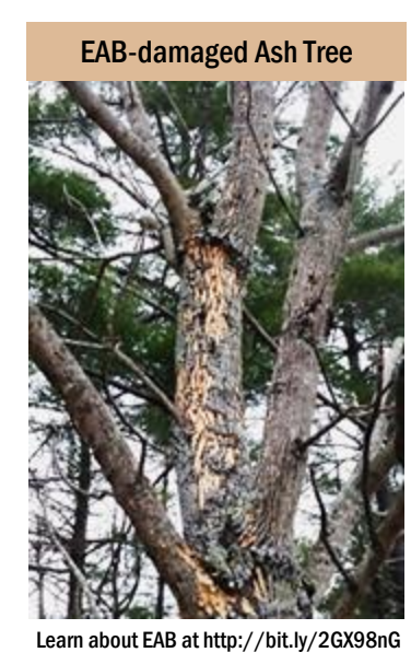
Board Tree Experts

Graphic: Adapted from U.S. Product Safety Commission; Data: http://bit.ly/2Fdtreh