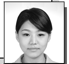
Photo fees can be included with the payment to the Mercer County Clerk

Children & Seniors (62 and older): $10 Adults: $15