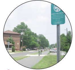
2 Adjacent to Railroad Ave.