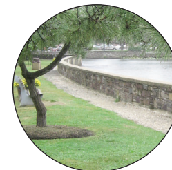
7 Adjacent to Peddie Lake