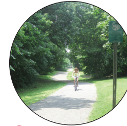
1 Near Dawes Park