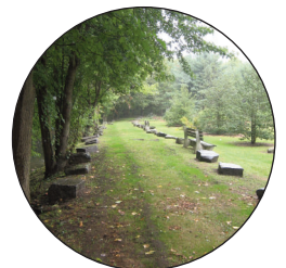
6 Adjacent to the Rocky Brook