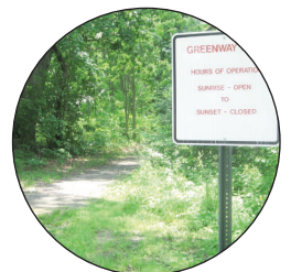
8 Woods entrance near Peddie Lake