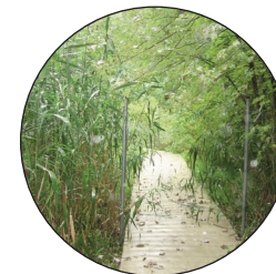
5 Wetlands in the Rocky Brook Environmental Area