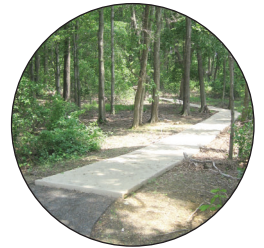
4 Wetlands near the Enchantment Community