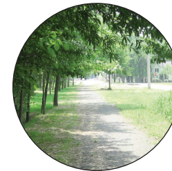
3 Adjacent to Cranbury Station Rd.